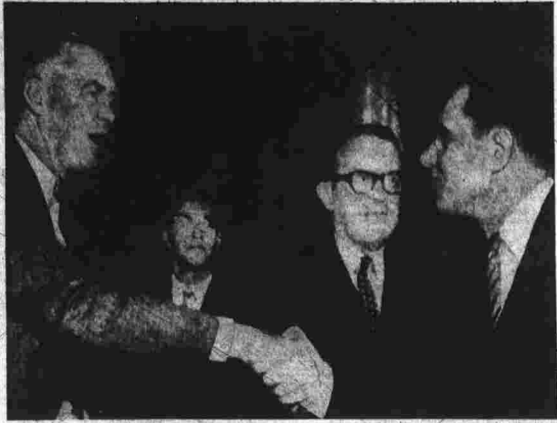
U.S. Secretary of State Christian A. Herter, left, shakes hands with Soviet Foreign Minister Andrei Gromyko at pre-conference luncheon in Geneva today. Second from right is Swiss Foreign Minister Max Petitpierre, luncheon host. Other man is not identified.