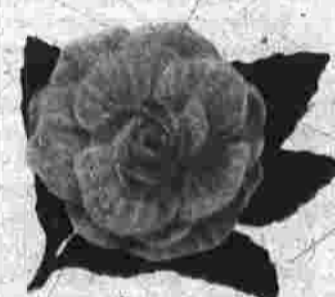
MAGNESIUM for blossom set, formation of chlorophyll and setting of seed.