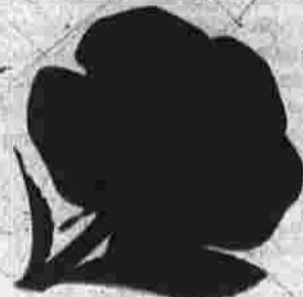
POTASH for strong stems, vivid color and resistance to disease.