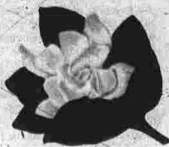
IRON for chlorophyll formation and to prevent die-back, grow sturdy plants.