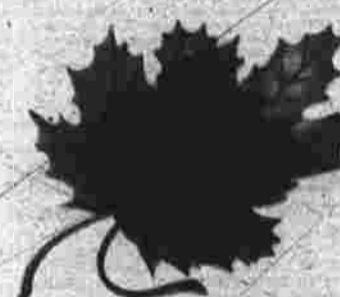
MANGANESE for leaf respiration, oxidation within the plant and fast growth.