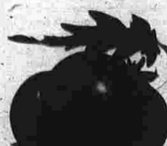
MOLYBDENUM for fruit set, and for vigorous, normal development and maturity.

Vigoro Complete Plant Foods added to your soil give plants everything they need for healthy, vigorous growth. They're all plant food—no filler. And remember, Vigoro Plant Food formulas can't be copied! Ask for Vigoro now at supermarkets, too.