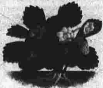
PHOSPHORUS for flowers, fruits and roots, for cell division and protoplasm.