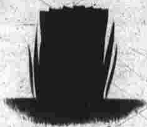
NITROGEN for leaf growth, protein, protoplasm and chlorophyll formation.