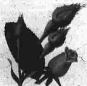
COPPER to prevent die-back, to aid in fruit set and to help plants use nitrogen.