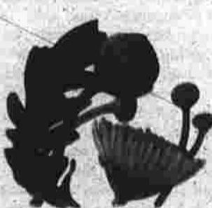
BORON for bud growth, for larger fruit, stronger roots and aid in calcium uptake.