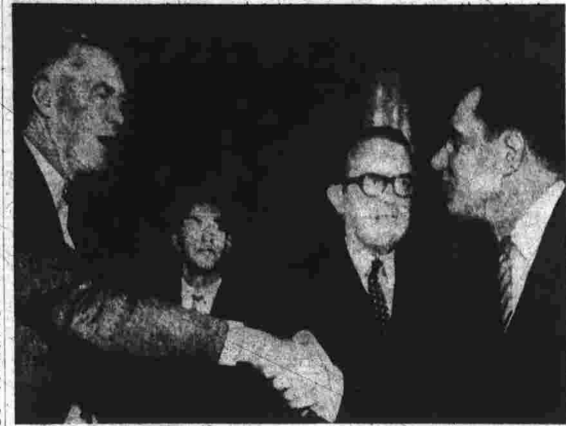
U.S. Secretary of State Christian A. Herter, left, shakes hands with Soviet Foreign Minister Andrei Gromyko at pre-conference luncheon in Geneva today.