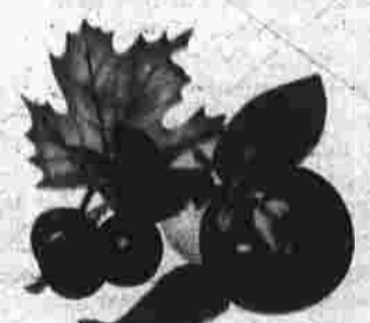
ZINC to aid in metabolism and enzyme systems that involve other nutrients.