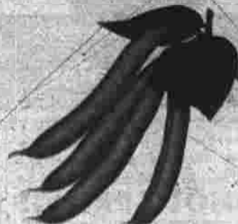
SULFUR for protein formation and odorous oils that impart fragrance, flavors.